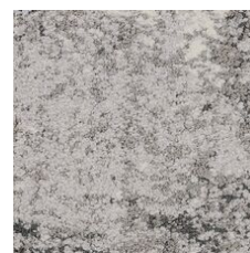
Greige 35516 LRV 36.9